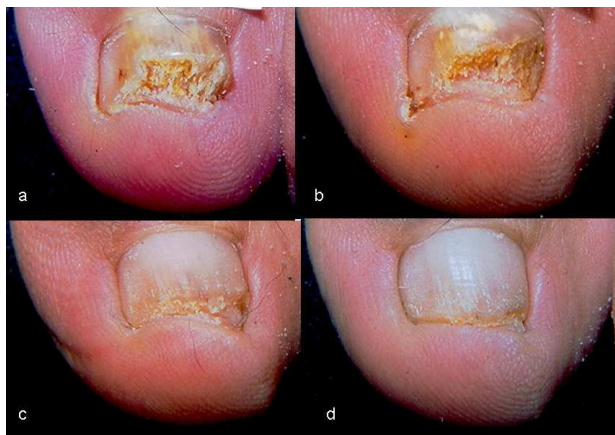
Figure 2. Example of treatment sequence

No changes in the blood count and the liver function tests were seen during the trial. Two patients reported side effects (6.25%), one of them had mild headache that lasted two days and the other one had moderate dysgeusia for 7 days. None of them warranted stopping the treatment.